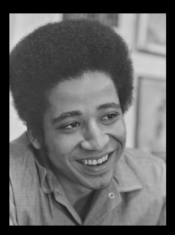
Photo of George Jackson taken at San Quentin Prison, November 5, 1970

"Black August is honored every year to commemorate the fallen freedom fighters of the Black Liberation Movement, to call for the release of political prisoners in the United States, to condemn the oppressive conditions of U.S. prisons, and to emphasize the continued importance of the Black Liberation struggle.